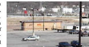
The East Plant on-site office.

There are currently twenty-eight sites enrolled in the program, twenty-one are former industrial sites. The largest is