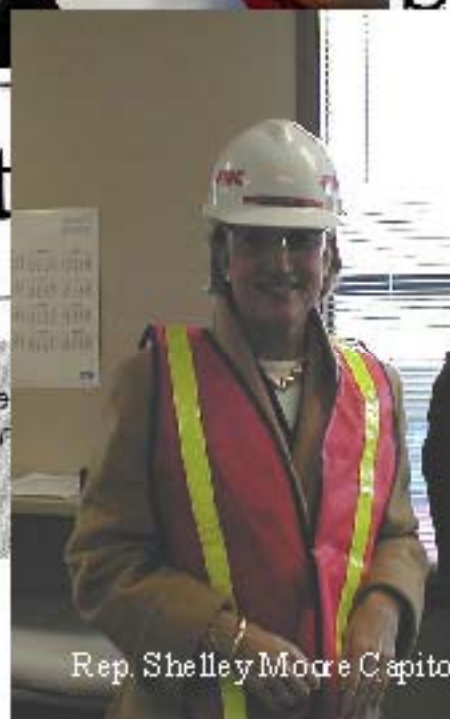
Rep. Shelley Moore Capito